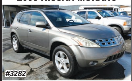
2003 NISSAN MURANO