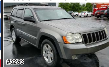
2008 JEEP GR. CHEROKEE