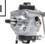
All Brands Gear, Vane Piston Pumps