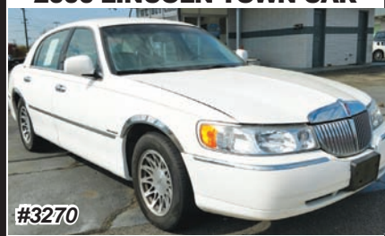
2000 LINCOLN TOWN CAR