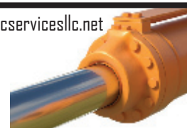
All Types of Cylinders