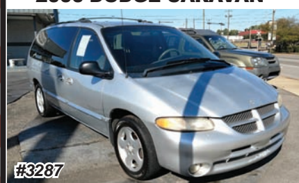
2000 DODGE CARAVAN