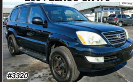
2004 LEXUS GX470

www.fannmotorsgallatin.com • And on FACEBOOK