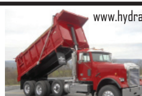
Lift Cylinder Repair