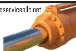
All Types of Cylinders