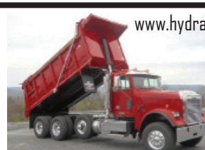
Lift Cylinder Repair