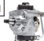
All Brands Gear, Vane Piston Pumps