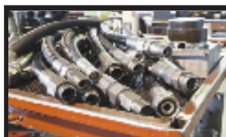
Bridgestone Hoses & Fittings

Serving Sumner, Macon, Trousdale Counties.