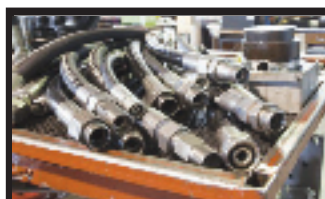
Bridgestone Hoses & Fittings

Serving Sumner, Macon, Trousdale Counties.