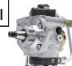
All Brands Gear, Vane Piston Pumps