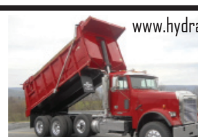
Lift Cylinder Repair