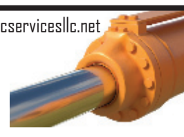
All Types of Cylinders