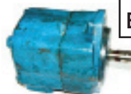
All Brands Hydraulic Motors

Cylinders • Pumps • Valves • Motor Repairs Bridgestone Hydraulic Hoses, Fittings and Oil