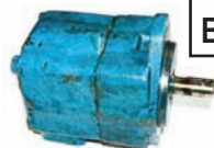
All Brands Hydraulic Motors

Cylinders • Pumps • Valves • Motor Repairs Bridgestone Hydraulic Hoses, Fittings and Oil