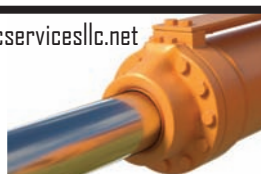
All Types of Cylinders