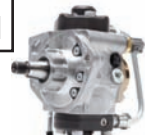
All Brands Gear, Vane Piston Pumps