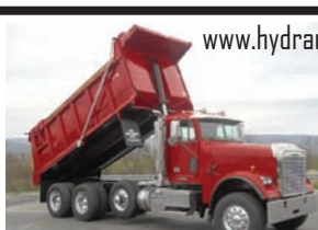
Lift Cylinder Repair