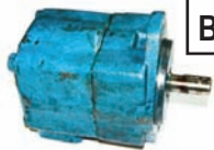
All Brands Hydraulic Motors

Cylinders • Pumps • Valves • Motor Repairs Bridgestone Hydraulic Hoses, Fittings and Oil