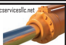
All Types of Cylinders