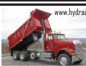
Lift Cylinder Repair