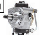
All Brands Gear Vane Piston Pumps